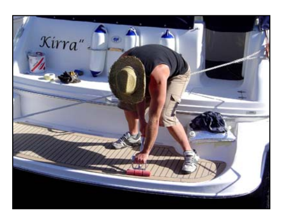
Fig. 5 Fig. 6

(TIP1: If you get any glue on the surface of your deck, leave it there until it dries and sand off with 60# sandpaper).